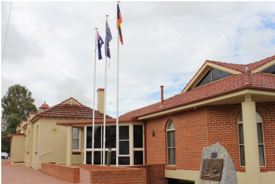
Uralla Shire Council Administration Centre 32 Salisbury Street, Uralla, NSW 2358

The Information Guide is available for inspection by the public at Council's Customer Service Centre at its Administration Offices at 32 Salisbury Street, Uralla during business hours or on Council's website at www.uralla.nsw.gov.au .