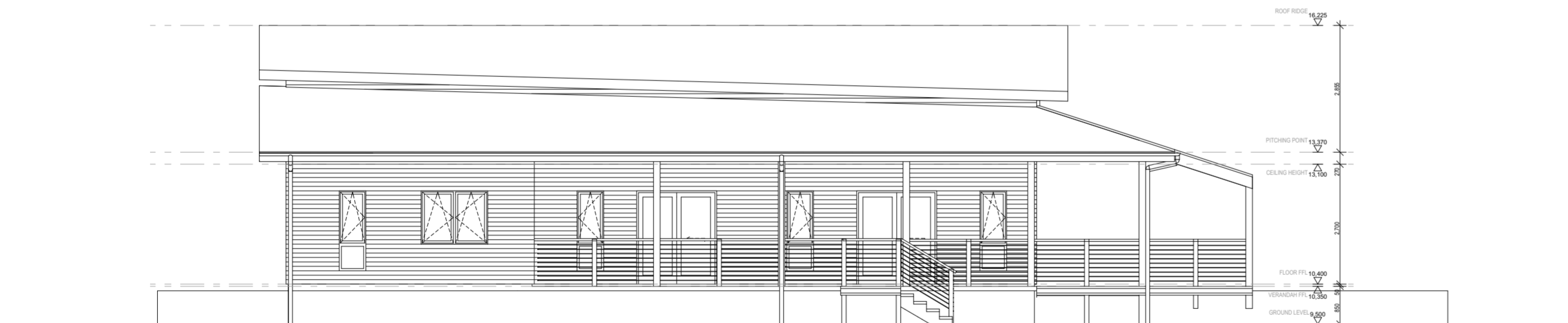
East Elevation 1:100