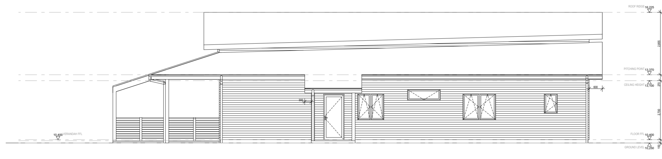
West Elevation 1:100

200 150 100 50 10 length in millimeters at full size