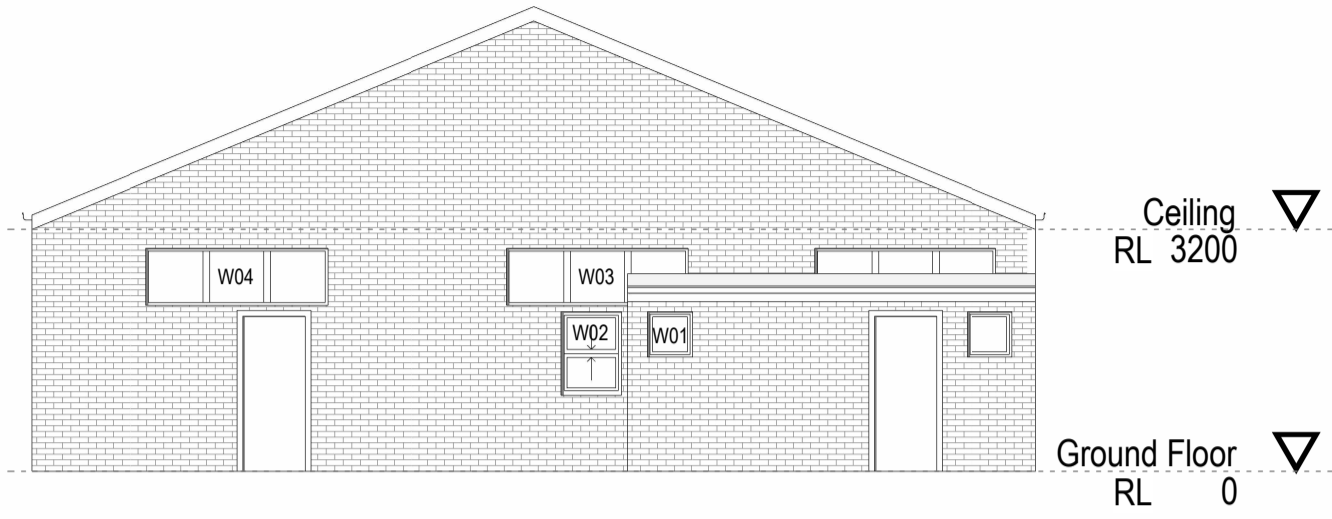
1 South Elevation 1 : 100