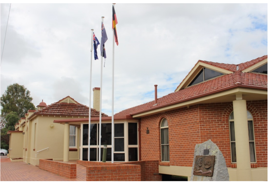
Uralla Shire Council Administration Centre 32 Salisbury Street, Uralla, NSW 2358

The Information Guide is available for inspection by the public at Council's Customer Service Centre at its Administration Offices at 32 Salisbury Street, Uralla during business hours or on Council's website at <u>www.uralla.nsw.gov.au</u>.